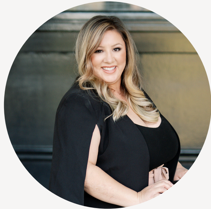
FOUNDER & MASTER STYLIST