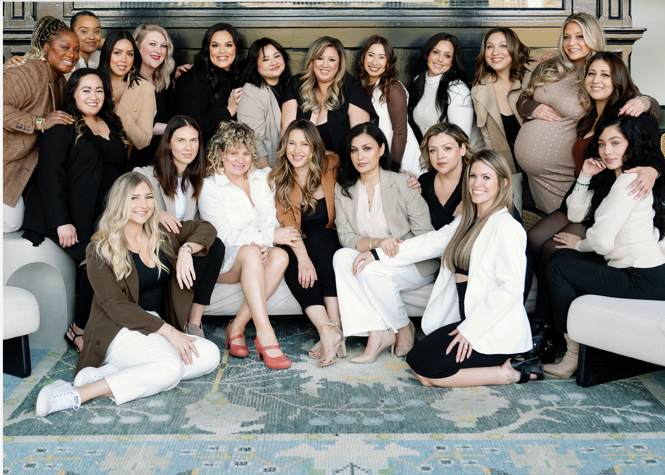
BELLA BRIDAL TEAM